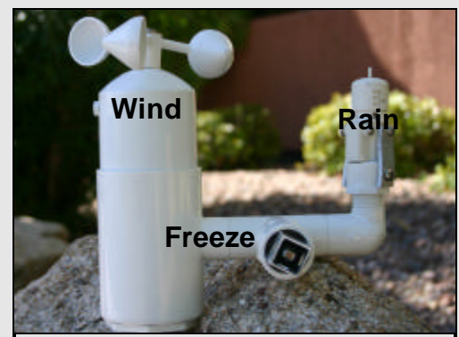
Irrigation shutoff devices. Clockwise, from upper left: rain, wind and temperature.

For example, a lawn in full sun will demand more frequent irrigation than an established plant bed of shrubs in the shade. Also, the use of irrigation shutoff devices, will conserve water.