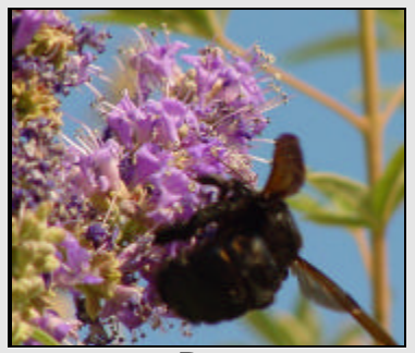
Bee Carpenter Bee Xylocopa varipuncta