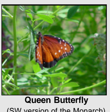
(SW version of the Monarch) Danaus gilippus

Meet some of the "Good Guys." Help protect these beneficial organisms so that they can naturally keep pests under control. Also, the use of traps and biopesticides will help.