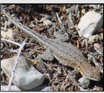
Desert Spiny Lizard Sceloporus magister magister