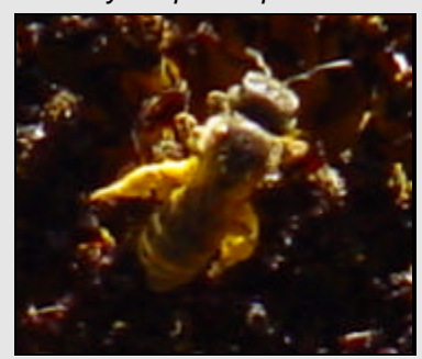
Honey Bee Apis mellifera