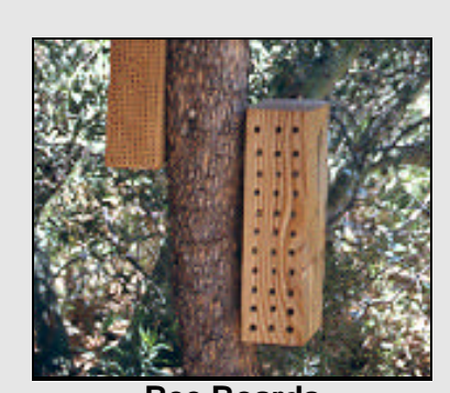
Bee Boards (Leaf Cutter Bee Nest)